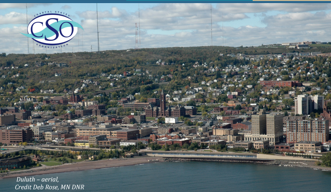
Duluth – aerial