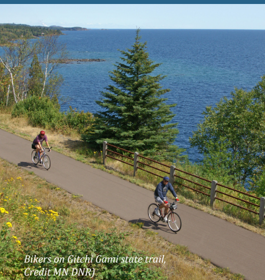
Bikers on Gitchi Gami state trail

Minnesota's Lake Superior Coastal Program's mission is to preserve, protect, enhance, and where possible, restore or enhance coastal resources along Minnesota's North Shore of Lake Superior for present and future generations.