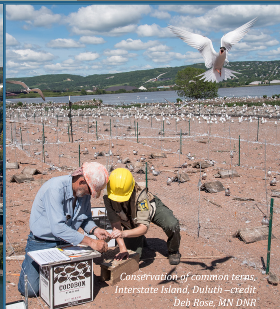
Conservation of common terns, Interstate Island, Duluth