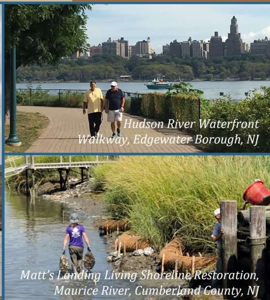
Hudson River Waterfront Walkway, Edgewater Borough, NJ