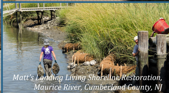
Matt's Landing Living Shoreline Restoration, Maurice River, Cumberland County, NJ