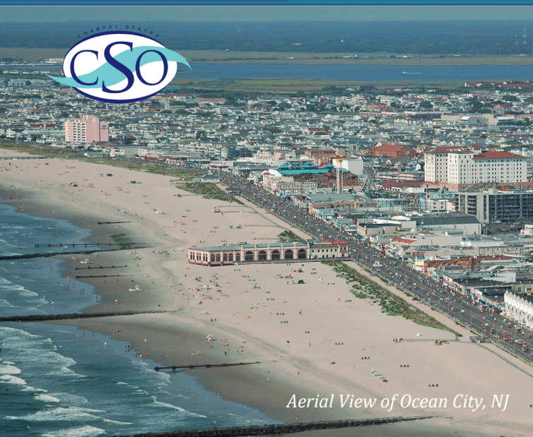
Aerial View of Ocean City, NJ